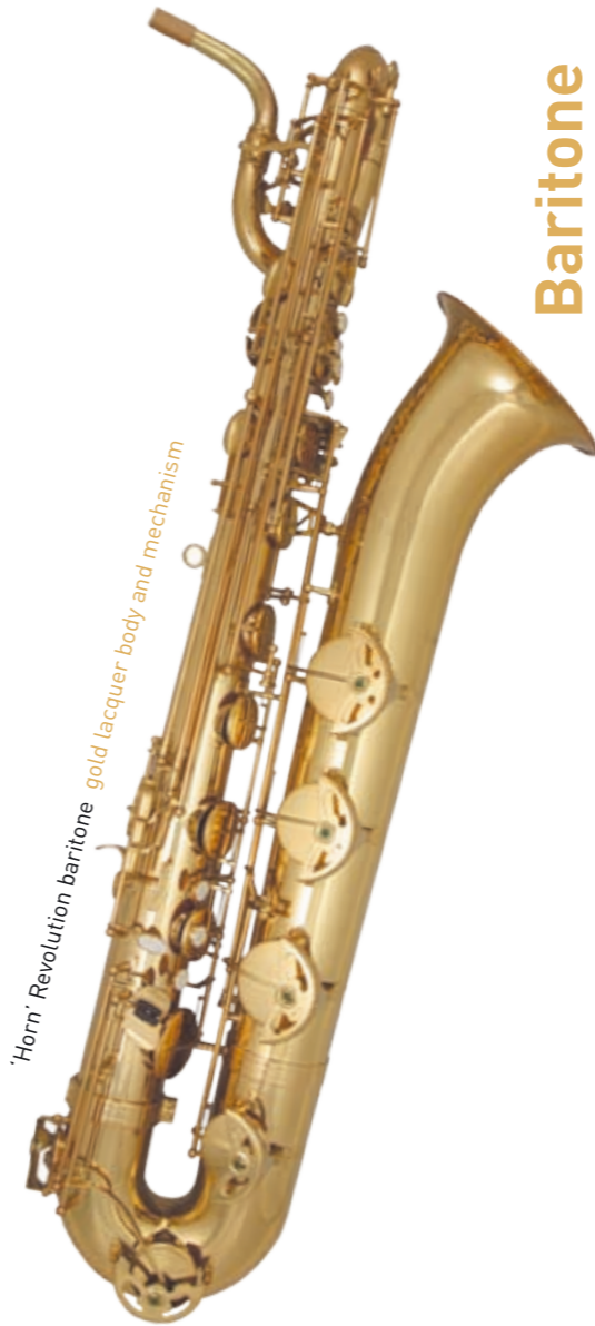
'Horn' Revolution baritone gold lacquer body and mechanism