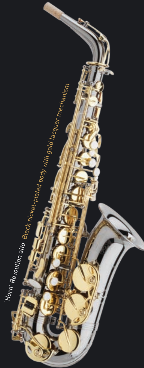
'Horn' Revolution alto Black nickel-plated body with gold lacquer mechanism