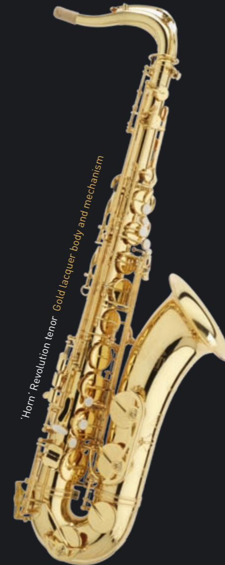
'Horn' Revolution tenor Gold lacquer body and mechanism