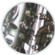
Black frosted body and mechanism