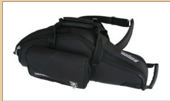
Deluxe rucksack case for Signature Custom