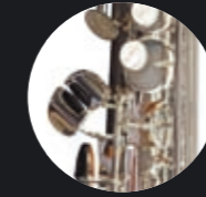
Silver-plated body and mechanism