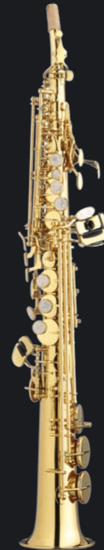
Gold lacquer body and mechanism