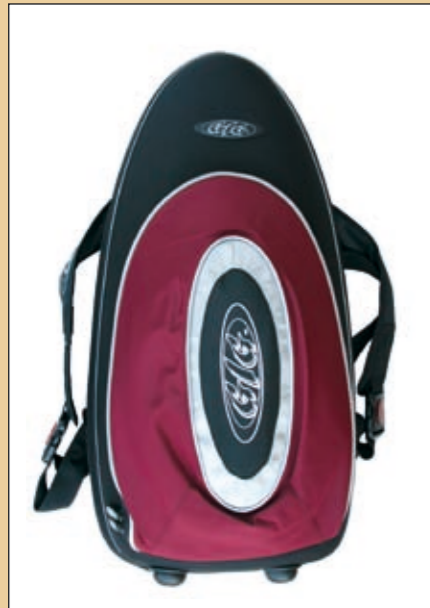
Gig bag rucksack case option for 'Horn' Revolution alto and tenor saxophones