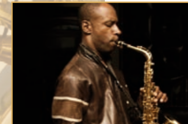
Page 4 – 8 TJ 'Horn' Revolution Range