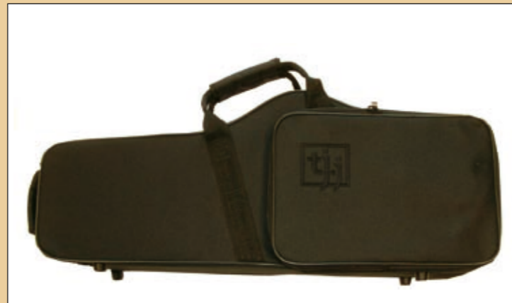
'Prolite' rucksack for 'Horn' Classic Models

* Refer to Trevor James guarantee booklet, or visit our website, for terms and conditions.