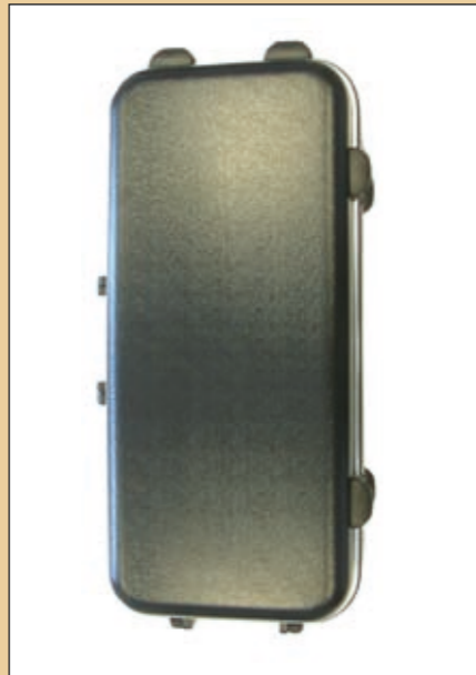
Moulded case for 'Horn' Revolution Range