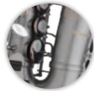
Black frosted body and mechanism