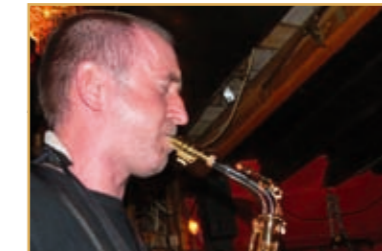
Page 9 – 11 Signature Custom Series