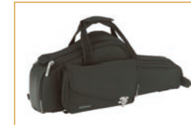
Page 12 TJ Saxophone Cases