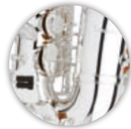
Silver-plated body and mechanism