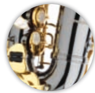
Black nickel-plated body with gold lacquer mechanism