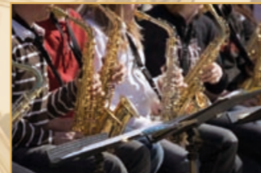
Page 2 – 3 TJ 'Horn' Classic Models