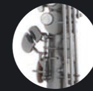
Black frosted body and mechanism