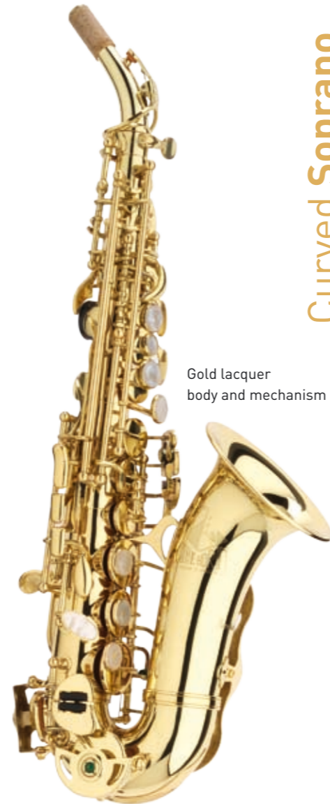
Gold lacquer body and mechanism